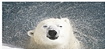
POLAR BEAR AT ZOO IN SAINT-FELIX, QUEBEC.

Escaping Arctic warming Recent polar bear generations have migrated north seeking year-round sea ice, researchers found. A3