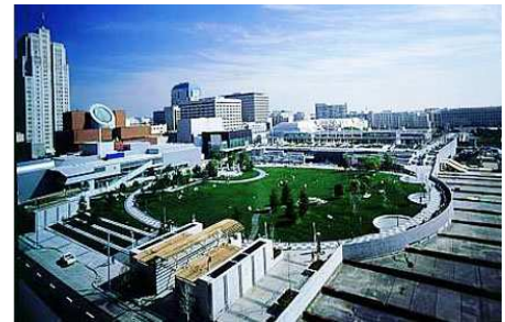
Yerba Buena Gardens

San Francisco is the home of the Golden Gate Bridge. Here you can learn about California's culture at the Yerba Buena Gardens or the California Academy of Sciences - or enjoy one of the many restaurants and theatres!