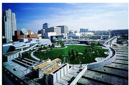
Yerba Buena Gardens

San Francisco is the home of the Golden Gate Bridge. Here you can learn about California's culture at the Yerba Buena Gardens or the California Academy of Sciences - or enjoy one of the many restaurants and theatres!