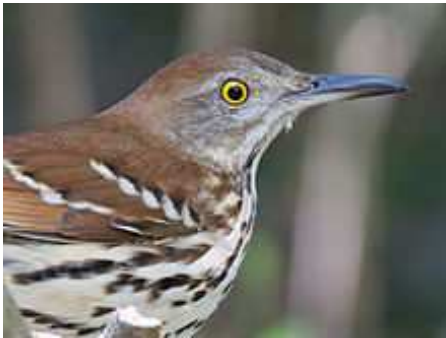
A brown thrasher (dt. rote Spottedrossel), Georgia's state bird

Major cities of Georgia are Atlanta (capital) with 456,000, Augusta with 201,000, and Macon with 200,000 inhabitants.